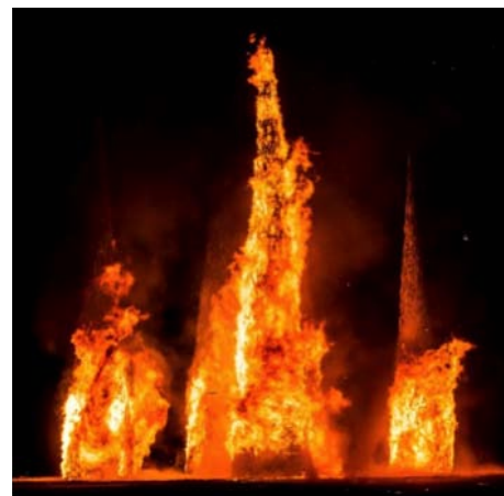
Figure 8b Burning of Subterrafuge.

Ritual is central to all burns, be they large or small. In the case of Clan 2015 , messages and tokens had been placed all over it during the days preceding the evening of Friday, 1st May. On the evening of the burn, people were drawn to Clan 2015 by mutant vehicles and roaming sound systems. Performance of Dance of a thousand flames by fire dancers of the Flow Arts