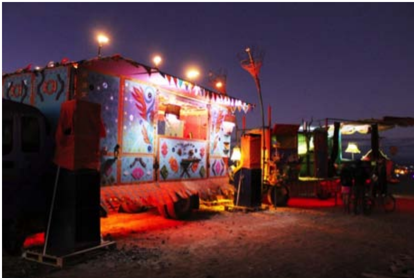
Figure 3a, above. VuvuLounge 2.0.