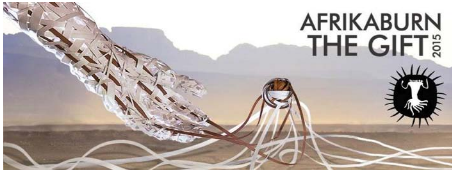
Figure 1 The 2015 AfrikaBurn Ticket by Sandy Mclea.

Tretter 2014: 62). Alternatively, the 2013 installation, Homing , by Jenna Burchill, is a high-tech “meticulously hand-built interactive environment [located inside a building] designed to be an accessible and exciting meeting of contemporary art, sounds and live interactive participation” ( http://www.art.co.za/jennaburchell/homing , accessed 3rd August 2015).