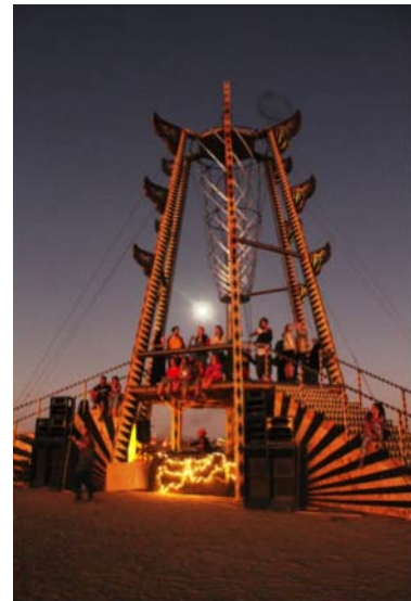
Figure 3b, right. Satori.