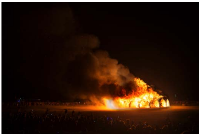
Figure 8a Burning of The Clan 2015.

Honey has explained (media briefing of 1st May 2015) that both Subterrafuge and Clan 2015 , each using about 20 tons of wood, were designed and built with fire in mind (figures 8a and b). Wood and combustibles were sculpted so as to deliberately shape fire. He thus sculpted these works, aiming for fruition of shape, form and concept, to occur at peak instants of physical destruction, when the fire would be at its fullest power and sculpted glory, at the very moment when the wooden structures themselves were being totally consumed by fire. Such large-scale fire art is unprecedented in South Africa, and ceremonial burning is powerfully transformative when connected, as at AfrikaBurn, to rituals “representing cleansing, purification, and release” (Kristen 2007: 333).